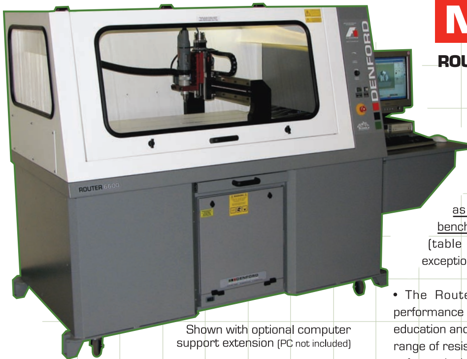
Shown with optional computer support extension (PC not included)

AVAILABLE WITH 5 STATION AUTOMATIC TOOL CHANGER